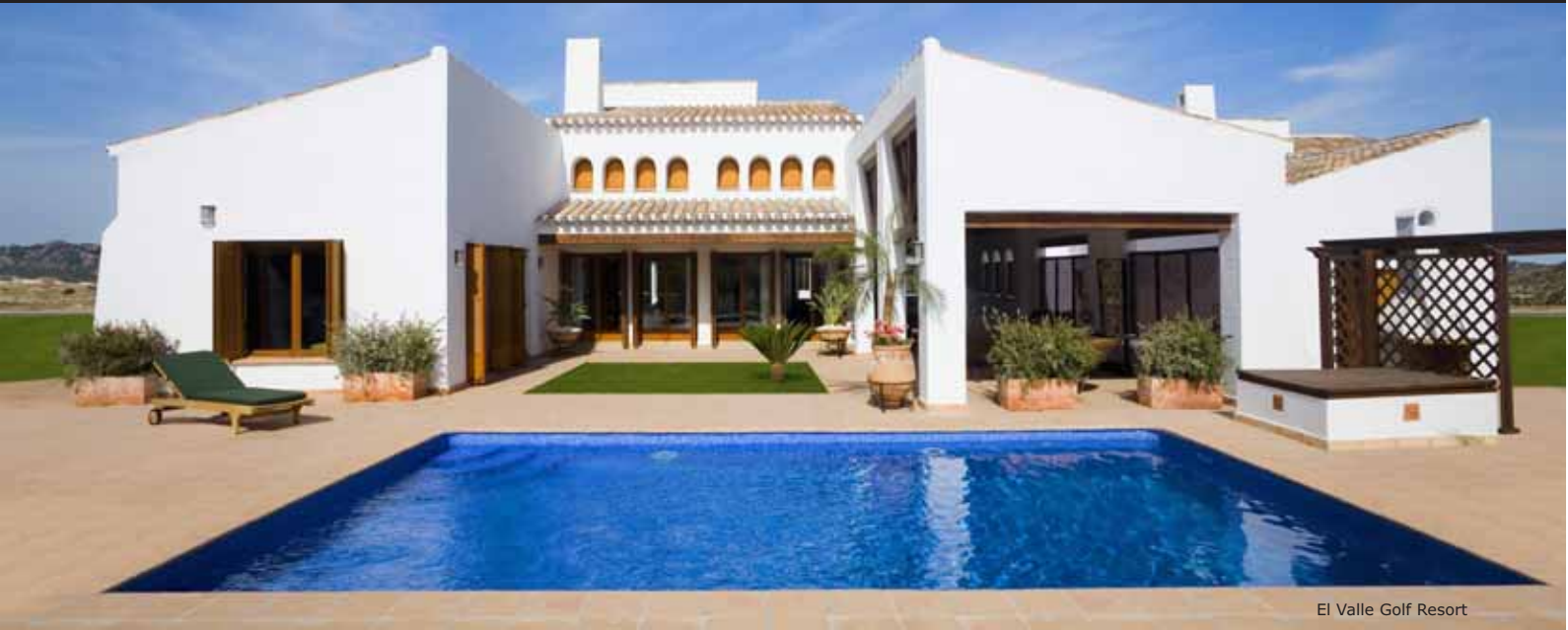
El Valle Golf Resort

The elegance of El Valle reflected in La Loma Golf Resort